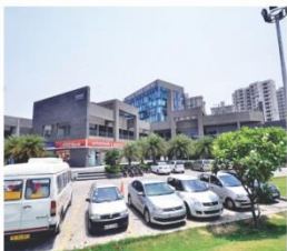
PARAS TRADE CENTRE Delivered