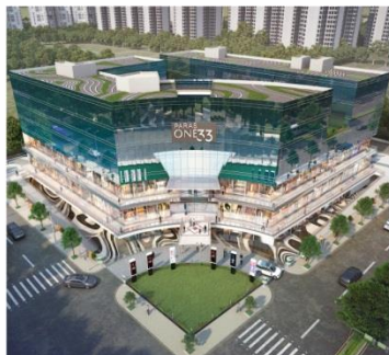
PARAS ONE33 On going