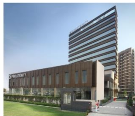
PARAS TRINITY Delivered

In over a decade since its inception, stability and timely delivery have become hallmark of Parus Buildtech. In this span, the company has delivered approx. 6.5 million sq. feet and is working on multi scale projects.