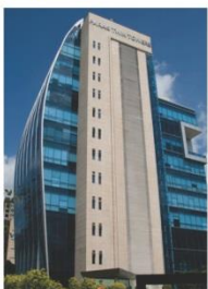
PARAS TWIN TOWERS Delivered