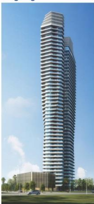
PARAS QUARTIER On going