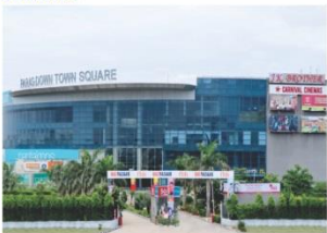
PARAS DOWNTOWN SQUARE Delivered