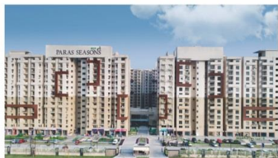
PARAS SEASONS Delivered