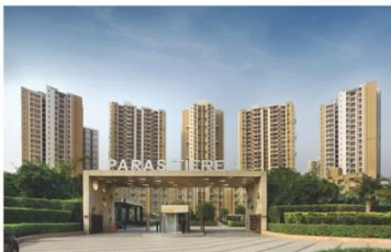
PARAS TIEREA Delivered