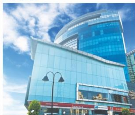
PARAS DOWNTOWN CENTER Delivered