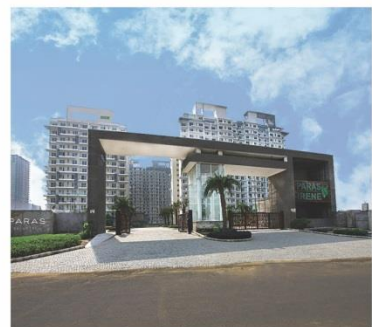
PARAS IRENE Delivered